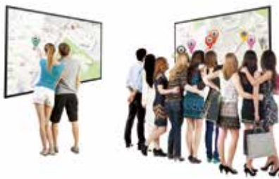
2 ~ 6 Point

Provides a more realistic sense of touch since it can recognise up to 10 simultaneous touches at once without the need of a separate pen.